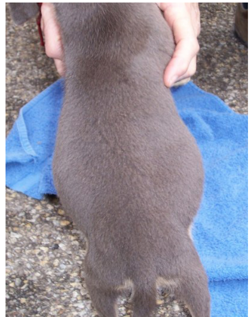
Puppy infected with parasites

If an animal shows the signs described above, treat it once and then 10 days later with one of the products described below. After the treatment, follow the prevention schedule described above.