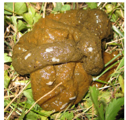
Tapeworms (grains of rice)

These parasites can only be treated with medications prescribed by a veterinarian. Contact the Veterinary Help Line to get a prescription.